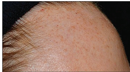
Before Fraxel DUAL Laser

For more information visit www.goldenbergdermatology.com/fraxel-DUAL/