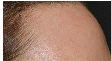
After Fraxel DUAL Laser