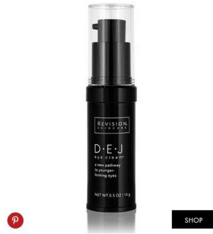
Revision DEJ Eye Cream $97