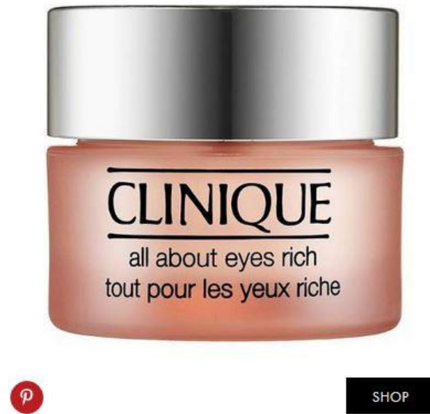
Clinique All About Eyes Rich $32