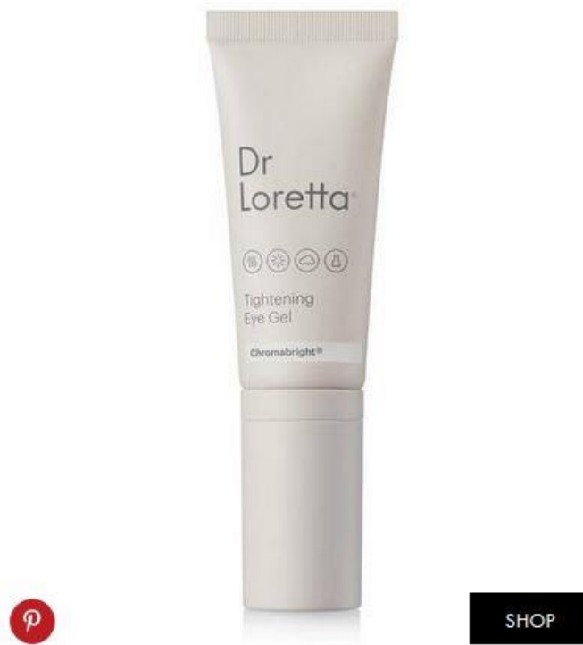
Dr. Loretta Tightening Eye Gel $60