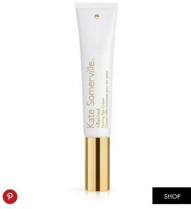
Kate Somerville Retinol Firming Eye Cream $85

"It contains peptides to stimulate collagen production. This minimizes fine lines and wrinkles," says Halem.