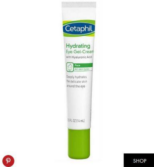
Cetaphil Hydrating Eye Gel Cream $14