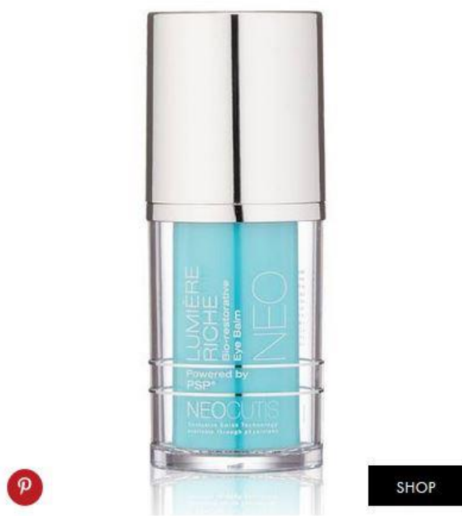
NeoCutiis Lumière Riche Bio-Restorative Eye Balm $85

"It contains peptides to stimulate collagen production. This minimizes fine lines and wrinkles," says Halem.