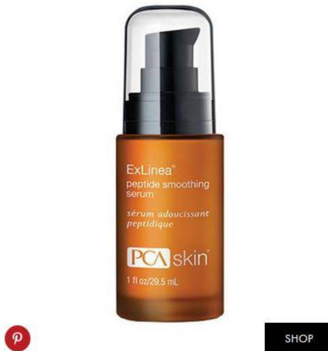
PCA Skin ExLinea Peptide Smoothing Serum $110