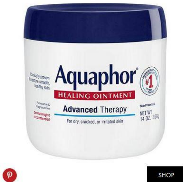
Aquaphor Advanced Therapy Healing Ointment $14