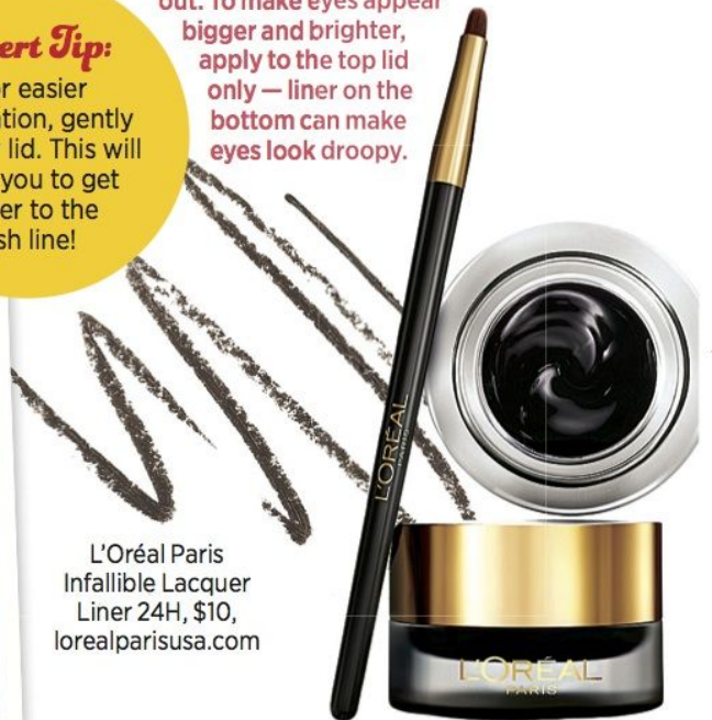
L'Oréal Paris Infallible Lacquer Liner 24H, $10, lorealparisusa.com

For easier application, gently lift your lid. This will allow you to get closer to the lash line!