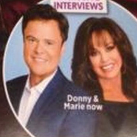
Donny & Marie now