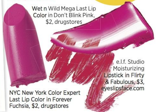
Wet n Wild Mega Last Lip Color in Don't Blink Pink, $2, drugstores

Before applying lipstick, rim lips with a matching lip liner to ensure color stays in place and to give lips a defined edge!