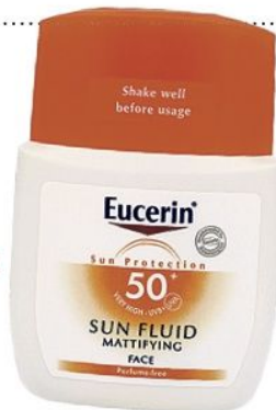
Eucerin Sun Fluid Mattifying Face SPF 50+, $17, lifeandlooks.com

A "Yes! Most face moisturizers with SPF provide the same UV protection [as sunscreen], but are specifically formulated for the face," says NYC-based dermatologist Dr. Gary Goldenberg. Regular sunscreens go on thick and greasy, which can lead to breakouts, but face moisturizers with SPF are designed with non-greasy, mattifying fluids that block harmful UV rays without clogging pores. For optimal performance, use a formula with SPF 50 and reapply it every two hours while in direct sun!