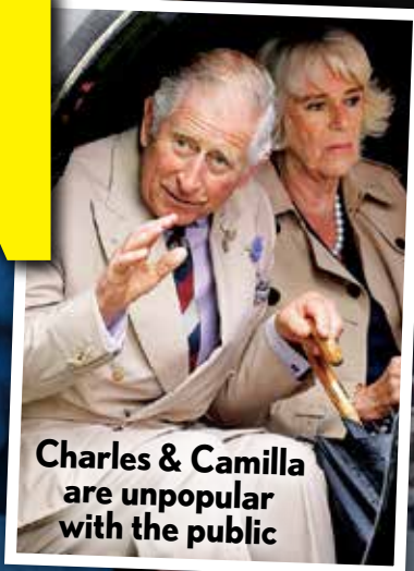
Charles & Camilla are unpopular with the public