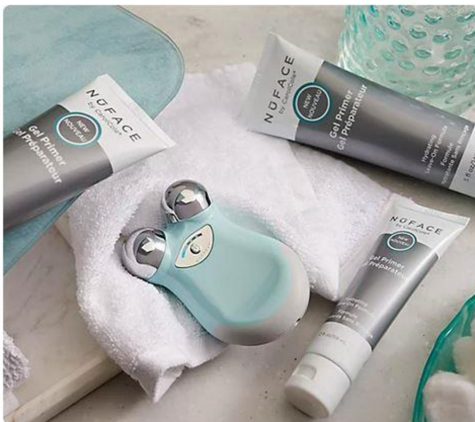
Banish fine lines and wrinkles with this little device.

Shop it: NuFACE Mini Face & Neck Toning Device, $159 (was $192), qvc.com