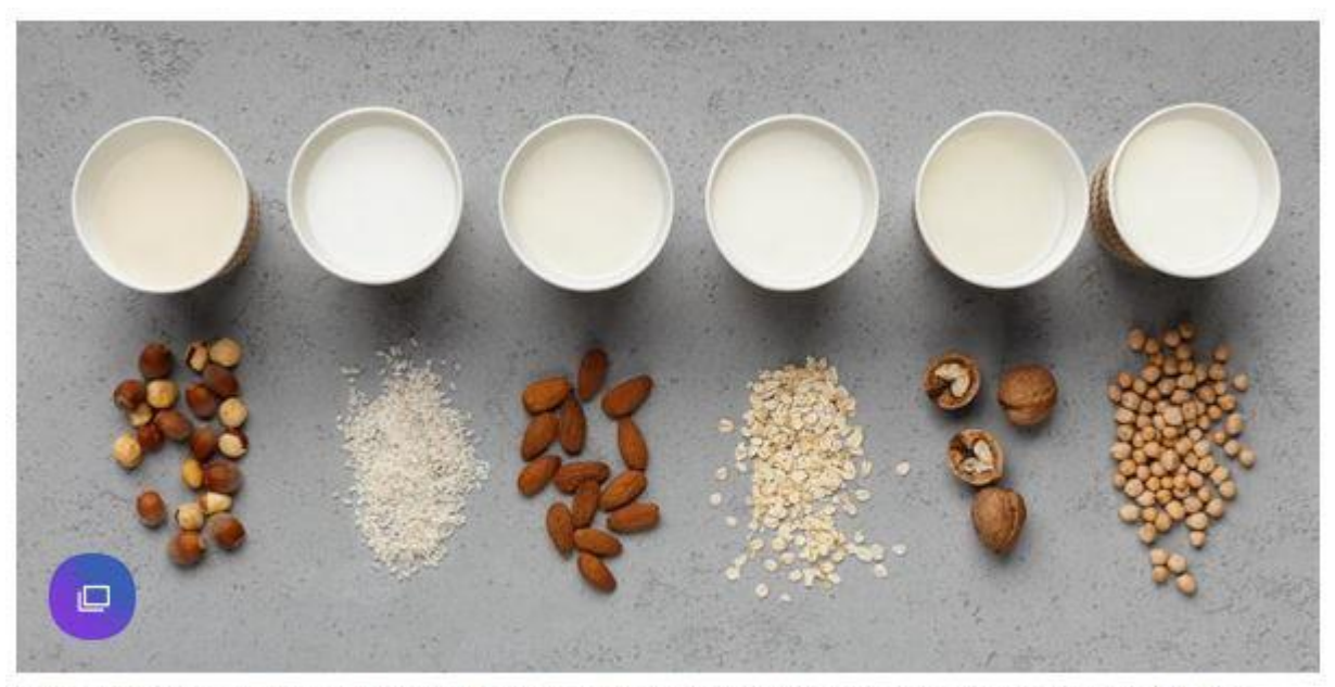
Have your tween swap out their milk for non-dairy alternatives, such as almond or coconut.

"High glycemic foods are those that raise your blood sugar fast," explains Bailey. Sugary foods and drinks are big culprits, but foods with refined carbohydrates like chips, crackers, pasta and pizza can be problematic, she says. Focusing on foods that are low-glycemic like oats, lentils, non-starchy vegetables and lean meats can help, says Bailey.