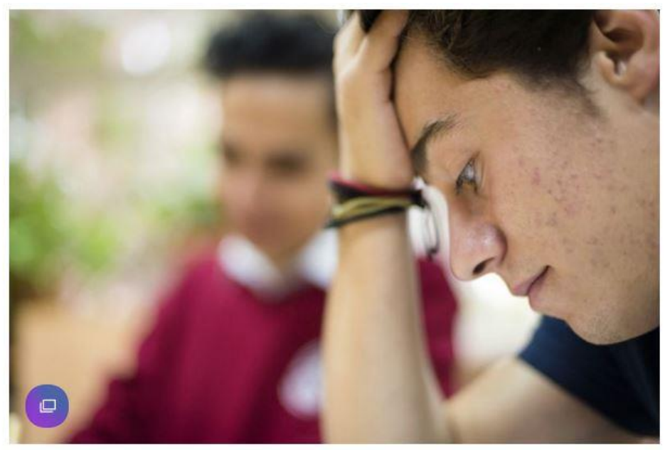
Your teen's diet, skincare routine and stress levels all play a role in their acne.

It's pretty much assumed that nearly every teen will deal with acne at some point. But, even though teenage acne is incredibly common, it can be hard to know how to help your child when they're going through it.