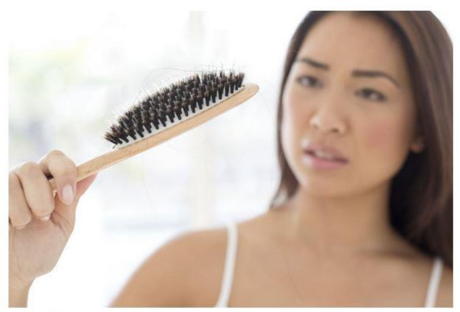
It sounds too good to be true, but according to two doctors, there's a reason Rogaine has been a best-seller for decades.

Much like taxes and death, hair loss is one of those things that we can't escape. It happens to everyone, men and women alike.