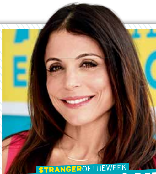
STRANGER OF THE WEEK

◀ TIC-TAC-TOE GAME This walnut-and-brass set will keep anyone under age 8 entertained for... several minutes at least. Worth it!