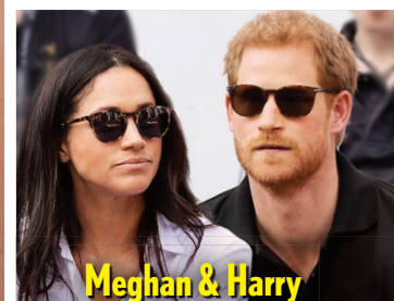
Meghan & Harry