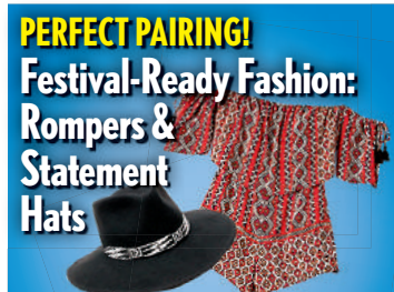
PERFECT PAIRING! Festival-Ready Fashion: Rompers & Statement Hats