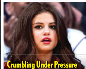
Crumbling Under Pressure TROUBLED SELENA UNDER ATTACK