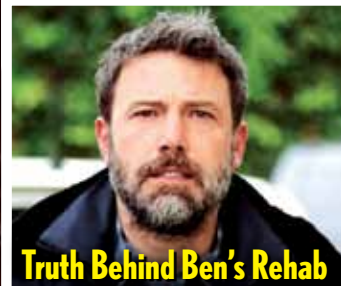
Truth Behind Ben's Rehab DAY DRINKING, LIES & BETRAYAL