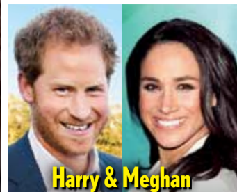
Harry & Meghan A ROYAL PROPOSAL

Perfect Pairing! BOOTS & BOMBERS YOU'LL LOVE