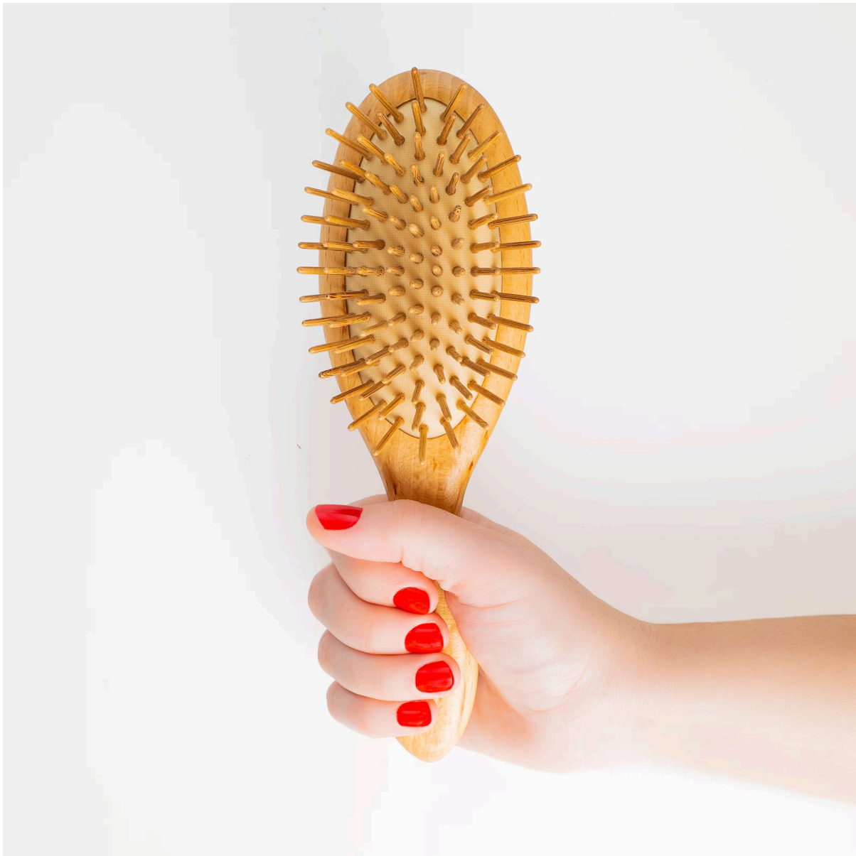
Israel Sebastian//Getty Images